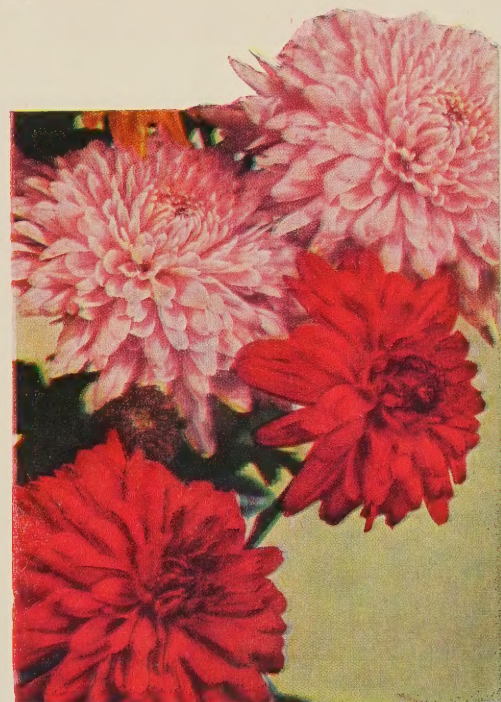
JEWELTONE (Pink). 60c each; 3 for $1.50 JUBILEE (Red). 60c each; 3 for $1.50